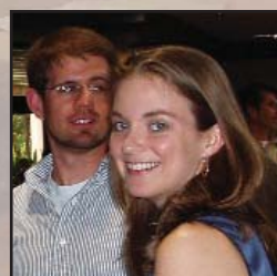
In addition to the lecture, a job fair was held and for the undergraduate and graduate students.