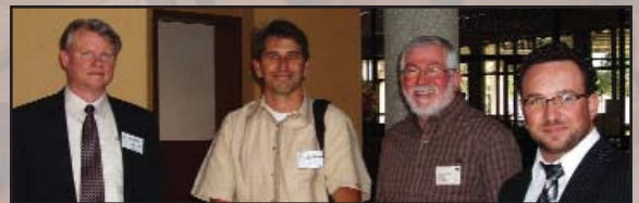
Alumni, students, industry representatives and CAEE faculty talk shop during the reception in April 2009.