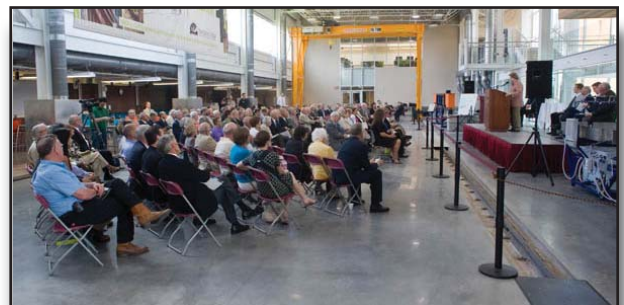
The civil engineering building on the University of Minnesota Duluth campus opened in the summer of 2010. This state-of-the-art building has exposed structural elements, making it a learning tool.