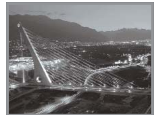
This award-winning, 997-foot long bridge crosses the Santa Catarina River in Monterrey, Mexico.

IBT has become internationally recognized for outstanding bridge engineering. In 2004, the company won the American Council of Engineering Companies Grand Award for Excellence in Engineering Design for the Santa Catarina Bridge in Monterrey, Mexico. IBT has completed other major bridge projects in Australia, India, Jamaica and the U.S.