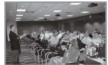
The Dallas Area Ethics Presentation was on May 8th at HKS, Inc.