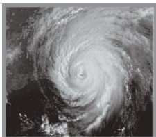
Hurricane Katrina as seen by NOAA satellite.

In an effort to provide a valuable service to our graduates as well as an opportunity to network, we invited CAEE alumni from Houston, Dallas and Austin to participate in area ethics presentations. At each respective lunchtime presentation, attendees received the 1-hour ethics requirement needed to maintain a P.E. license.