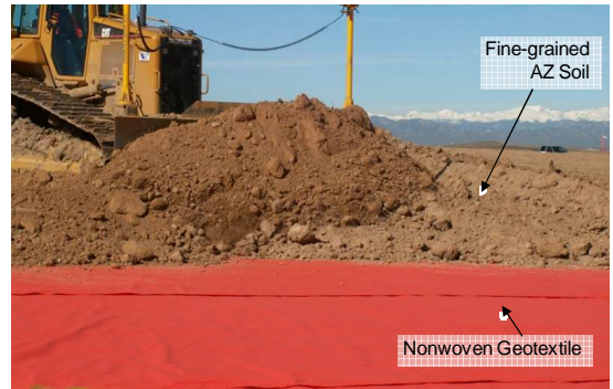
Fig. 4 Soil placement over the orange nonwoven geotextile used as capillary barrier in the Shell Cover (For colour figure, refer to CD)

The slope selected for the cover design was 3%. In addition, overland flow lengths were limited to 102 m to minimize rill and gully formation. Therefore, to minimize the amount of gradefill needed to achieve the overall 3% slopes, a “broken back” design was adopted that consisted of long, low slope drainage channels that cut through the large