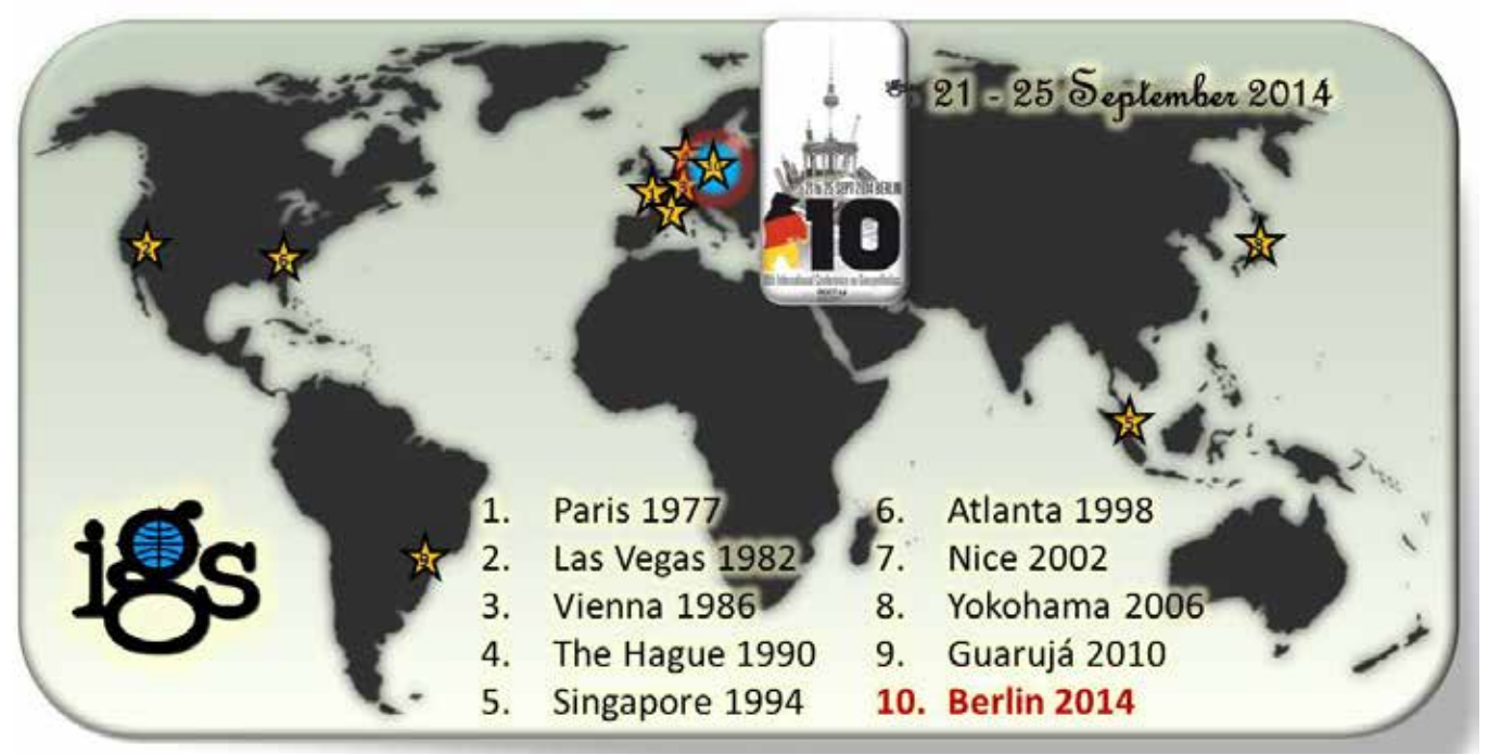
Figure 1. Location of the previous and upcoming International Conferences on Geosynthetics

The conferences of the IGS have played a remarkable role in the development of geosynthetic products and their applications. Much of the information on material properties, testing methods, applications and design approaches that we use in geosynthetics engineering has been vetted through these conferences. Of particular importance are the International Conferences on Geosynthetics. This series has been a premier outlet of, and in many cases has indeed triggered, many of the advances in geosynthetics. Figure 1 illustrates the location of the various international conferences (see yellow stars, with the corresponding conference number). As illustrated in this figure, the international conferences of the IGS have been well distributed throughout the globe. The first ICG was held in Paris (France) in 1977, and was followed by the 1982 Las Vegas (USA) conference, the 1986 Vienna (Austria) conference, the 1990 The Hague (Netherlands) conference, the 1994 Singapore conference, the 1998 Atlanta (USA) ICG, the 2002 ICG in Nice (France), the 2006 ICG in Yokohama (Japan), and the most recent event (9ICG) held in Guarujá (Brazil) in 2010. The forthcoming Berlin conference will be the 10<sup>th</sup> Conference of the important series of ICG events.