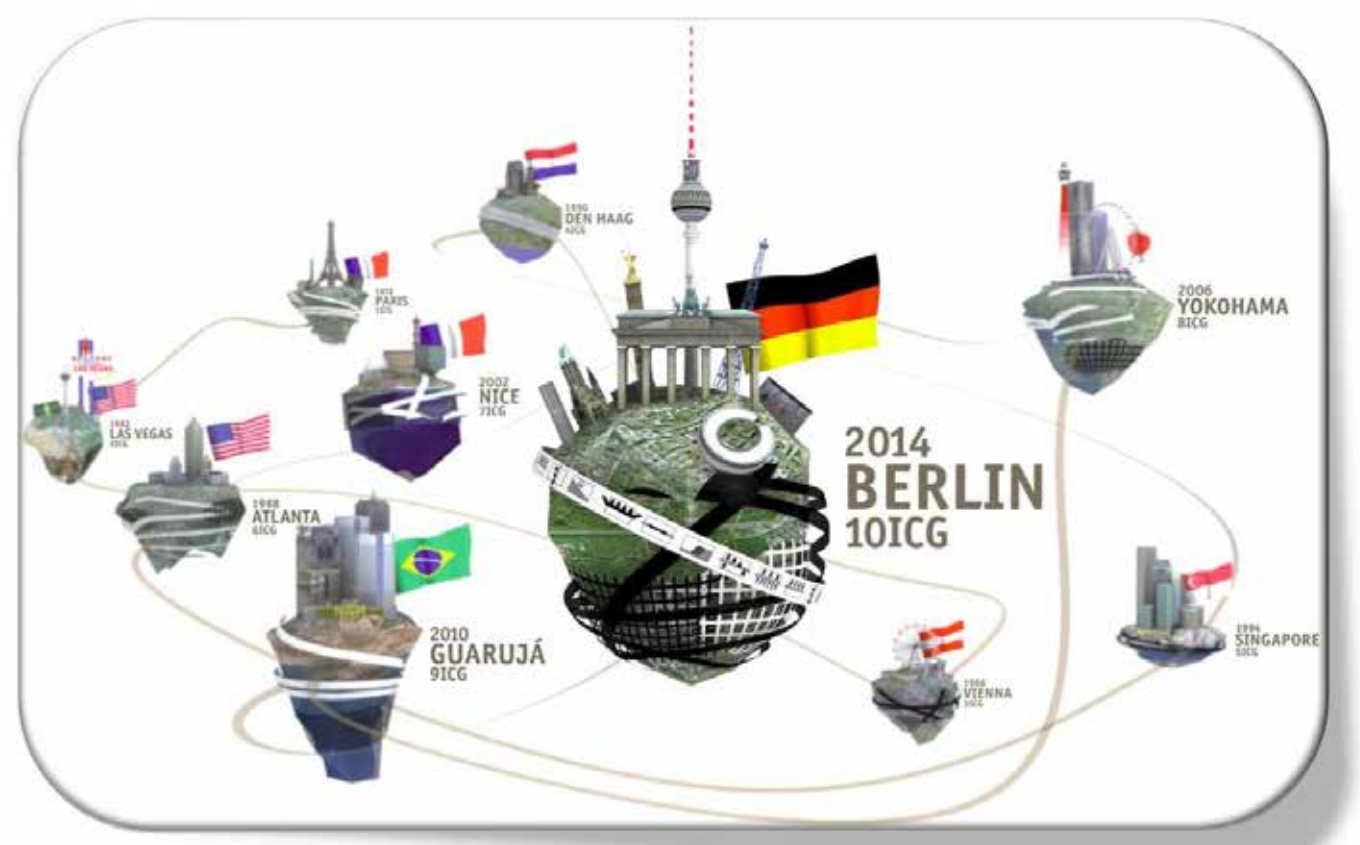
Figure 2. Location of the previous and upcoming International Conferences on Geosynthetics.

Figure 2 shows the same information as in Figure 1, but in a more interesting way, as conceived by the organizers of the 10ICG. Inspection of this figure will reveal an interesting mixture of artistic, historic, and "geosynthetic" views of our field. You may discover the characteristic landscape of the various conference locations. Can you find the multiple geosynthetics uses in this figure?