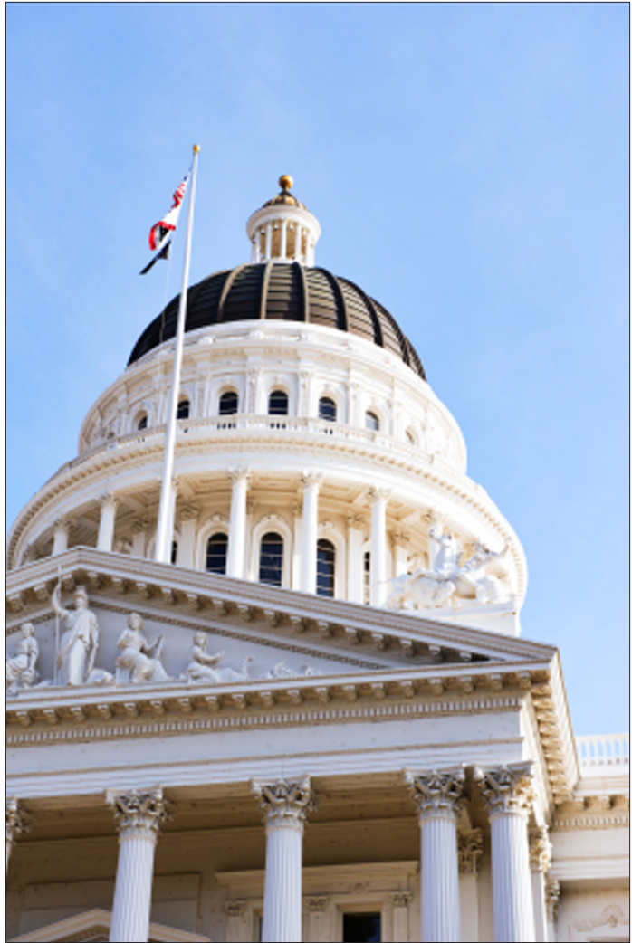
California-based consumer education and advocacy organization Consumer Watchdog raised privacy concerns during a recent round of AV-enabling legislation.

It is likely that crash data will be owned or made available to AV technology suppliers, since they will likely be responsible for damages in the event of a crash, provided that the AV was at fault. If a human is driving a vehicle with autonomous capabilities when the crash occurs, however, privacy concerns arise. No one wants his/her vehicle’s data recorder being used against them in court, though this is merely an extension of an existing issue: around 96 percent of new passenger vehicles sold in the U.S. today have similar (but less detailed) event data recorders that describe vehicle actions taken in the seconds prior to and following a crash, and NHTSA is considering mandating event data recorders on all new vehicles under 8,500 lbs. by late 2014. 70 While