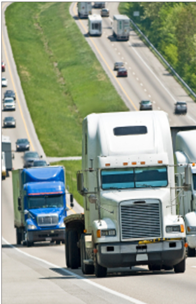
The same technologies that apply to autonomous cars can also apply to the trucking industry, increasing fuel economy and lowering the need for truck drivers.

Additional benefits can emerge through higher fuel economies when using tightly coupled road-train platoons, thanks to reduced air resistance of shared slipstreams, not to mention lowered travel times from higher capacity networks (a result of shorter headways and less incident-prone traffic conditions). Bullis 45 estimates that four-meter inter-truck spacings could reduce fuel consumption by 10 to 15 percent, and road-train platoons facilitate adaptive braking, potentially enabling further fuel savings. Kunze et al. 46 successfully demonstrated a trial run using 10-meter headways between