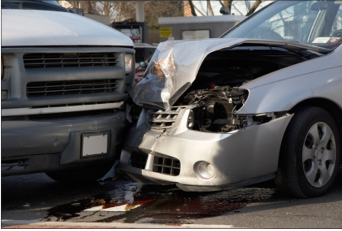
Even with near-perfect autonomous driving, there may be instances where a crash is unavoidable.

subject to certain geographic and/or environmental limitations (e.g., autonomous operation only on the state's interstates, for daytime driving free of snow and ice). While the proactive strategies pursued by these states is commendable, if many disparate versions of these crucial regulatory issues emerge (across distinct states), AV manufacturers will incur delays and increased production and testing costs.