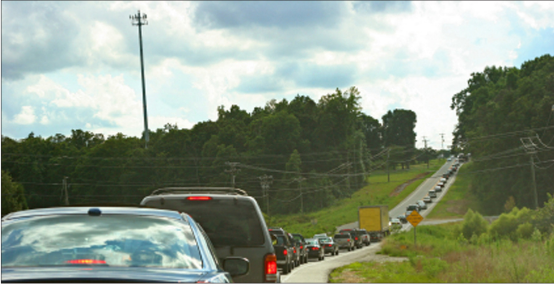
AVs can sense and possibly anticipate lead vehicles' braking and acceleration decisions. Such technology allows for smoother braking and fine speed adjustments of following vehicles, leading to fuel savings, less brake wear, and reductions in traffic-destabilizing shockwave propagation.

As the research shows, these benefits will not happen automatically. Many of these congestion-saving improvements depend not only on automated driving capabilities, but also on cooperative abilities through vehicle-to-vehicle (V2V) and vehicle-to-infrastructure (V2I) communication. But significant congestion reduction could occur if the safety benefits alone are realized. FHWA estimates that 25 percent of congestion is attributable to traffic incidents, around half of which are crashes. 26