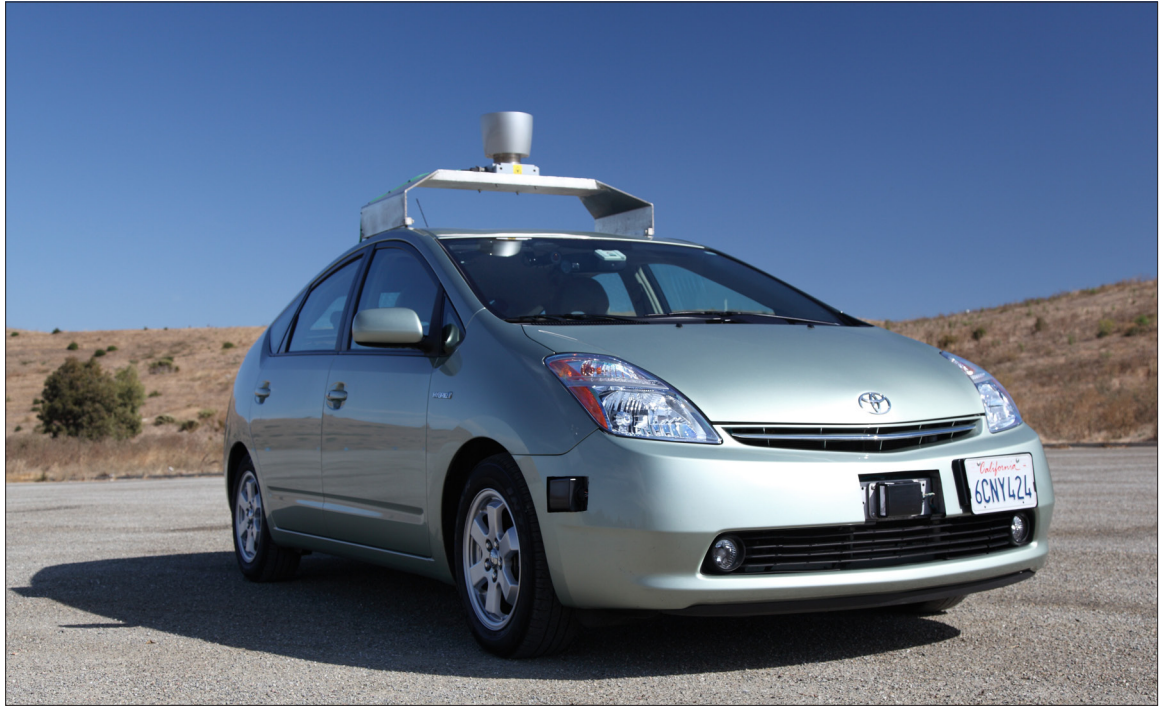
Google's Autonomous Vehicle.