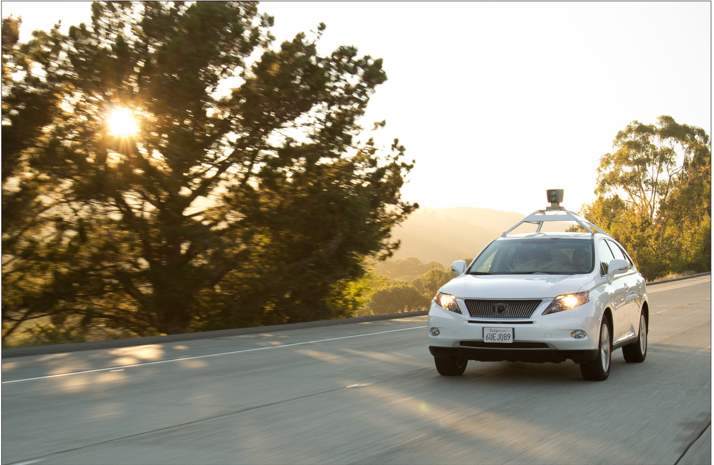
Car manufacturer Lexus test drives Google's autonomous vehicle.

ing a limited number of modifications to suit specific, local needs. Under such a framework, AV manufacturers will be better able to meet detailed national requirements and just a handful of possible individual state requirements, rather than trying to match 50 potentially different sets of testing requirements across states.