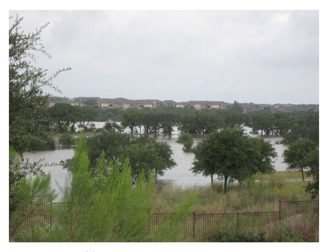
Across the golf course – 9/8/2010