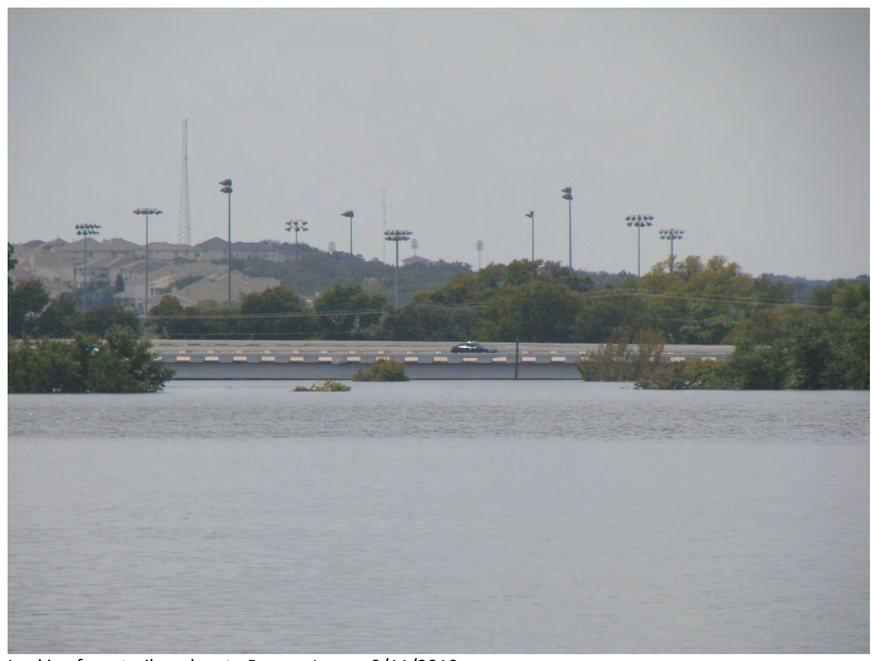
Looking from trail on dam to Parmer Lane – 9/11/2010