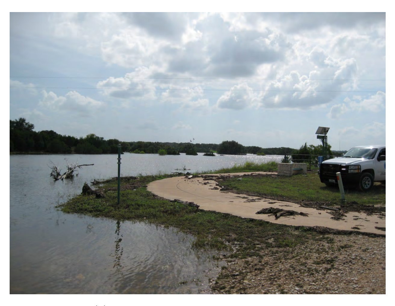
Emergency Spillway – 9/9/2010