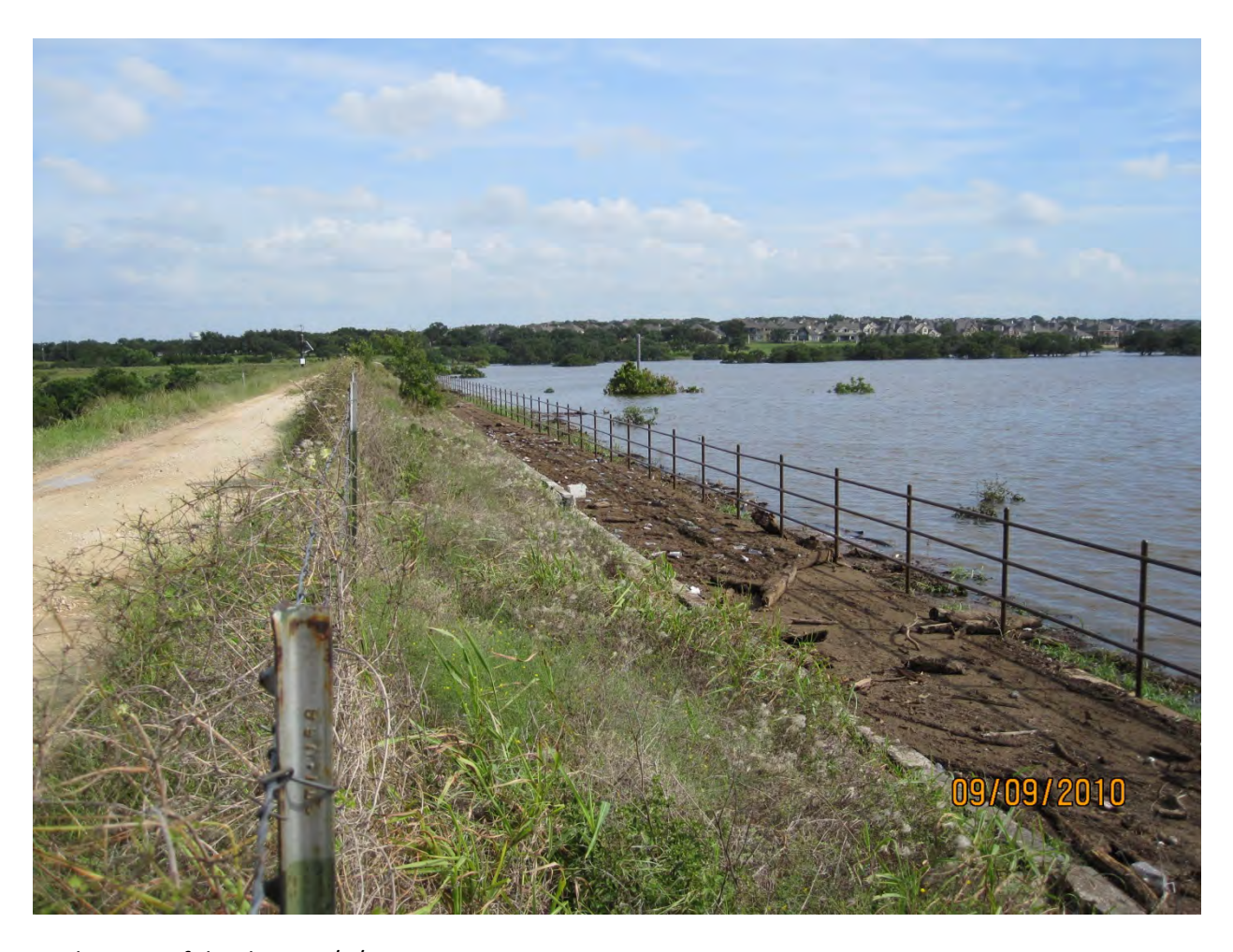
Trail on top of the dam – 9/9/2010