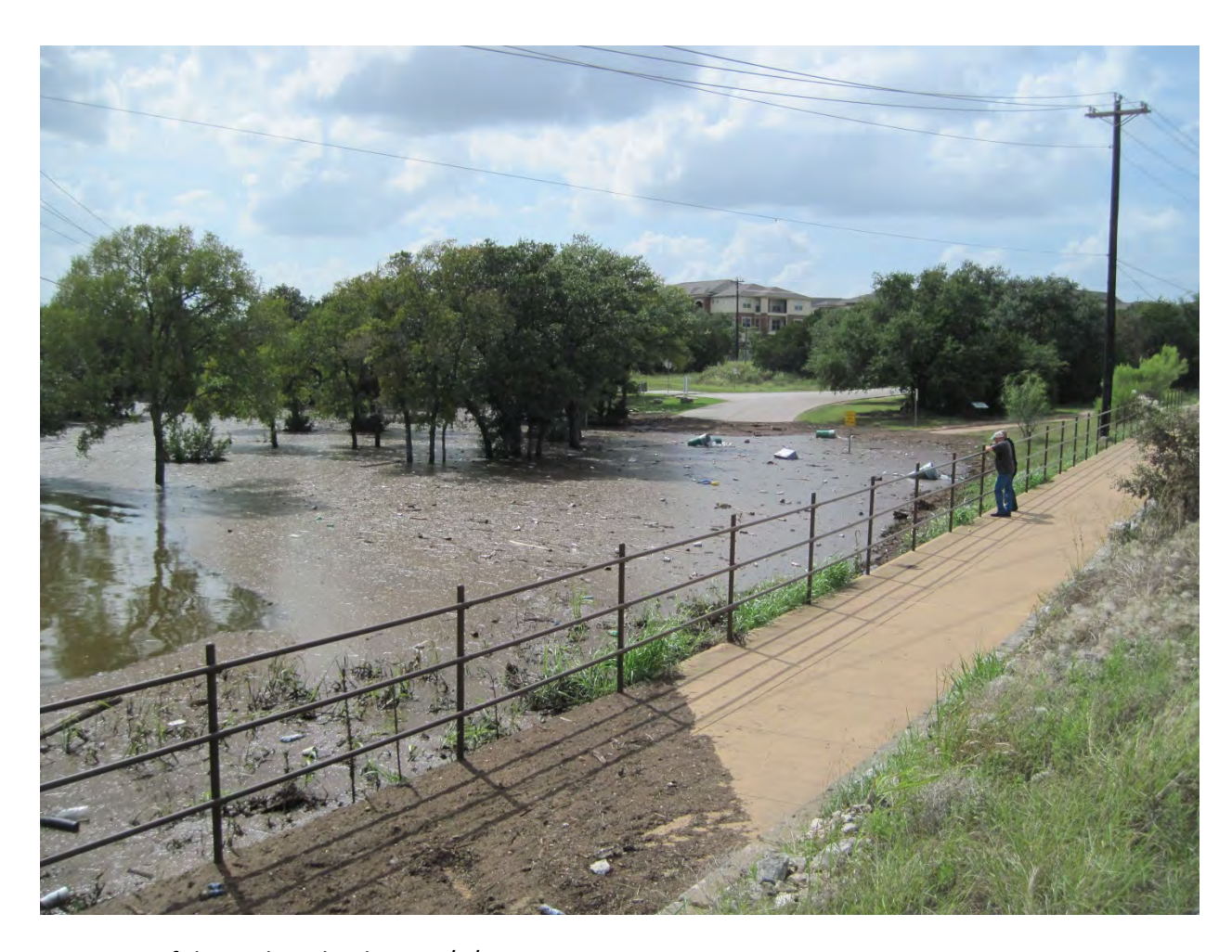
Beginning of the trail on the dam – 9/9/2010