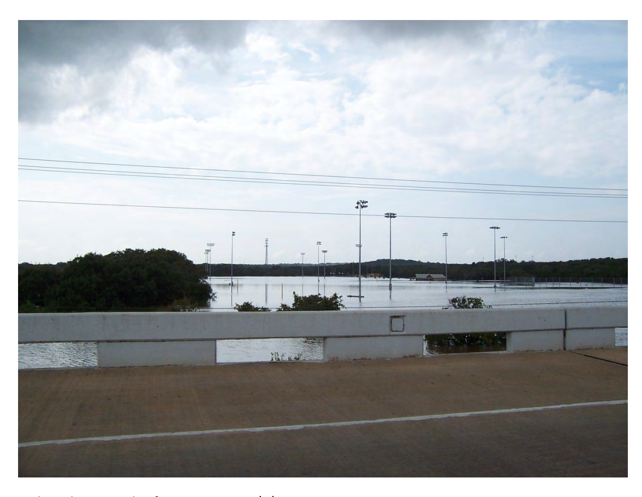
Park on the west side of Parmer Lane – 9/8/2010